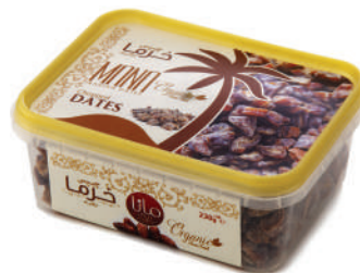
12 Jars in Box- Bulk Orders