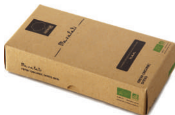
600 gr Box- Cartoon