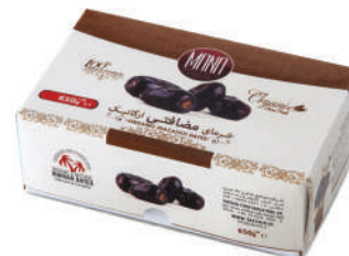
600 gr Box- Cartoon