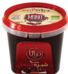
380 gr Jar