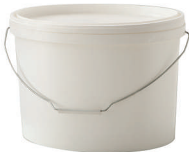
15 kg Bucket